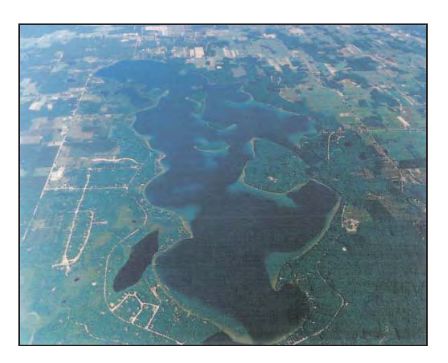
Long Lake Grand Traverse County

Published Quarterly - February, May, August and November